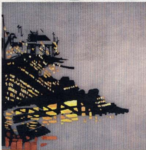
Harbour City Marina (+) Marina and Pavilion Aquatic Park (=) this painting on corrugated plastic. The Harbour City project, if completed, would have transformed what is now the Island Airport into a cross between Venice and Montreal's Habitat community.